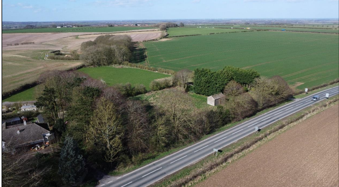
Viewing Care should be taken when viewing; you enter at your own risk. Photographs Photographs are provided for guidance only and should not be relied upon. Services We have not tested any services. Inclusions only items described in these particulars are intended for inclusion in the price. General These details are only a general guide to the property. They have been prepared in good faith and do not form any part of an offer or contract and must not be relied upon as statements or representations of fact. Neither Willsons nor their employees have any authority to make or give any representations or warranties whatsoever in relation to this property.