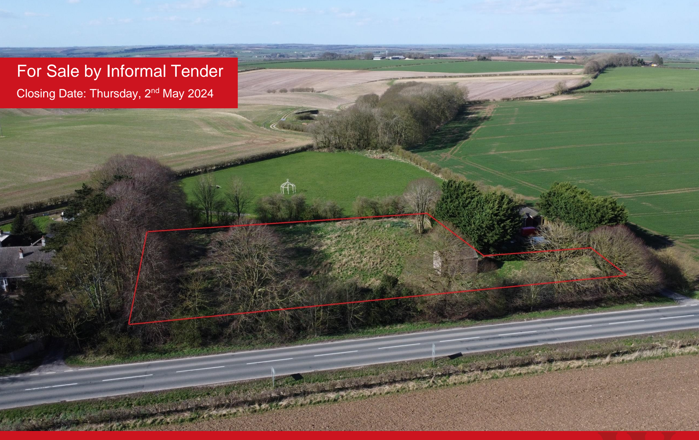
1.26 Acres (or thereabouts) of Pastureland A16, Ulceby Cross, Lincolnshire