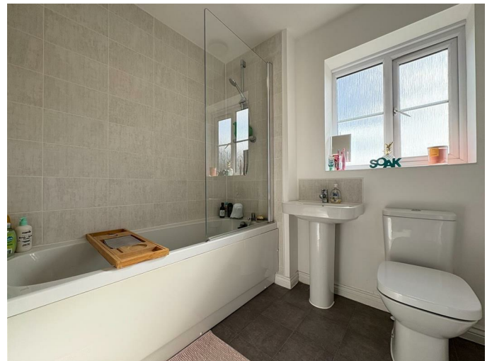
Family Bathroom 6'0 x 6'9 (1.83m x 2.06m)

Modern bathroom comprising bath with shower over, w/c, and wash hand basin, tiled walls around bath, and heated towel rail.