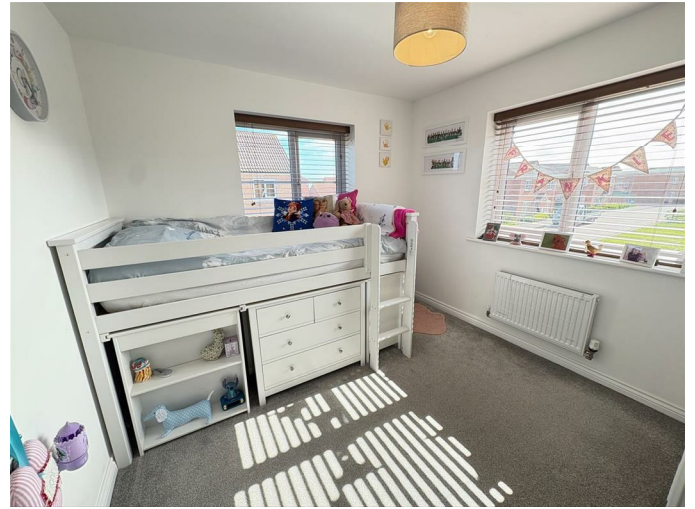
Bedroom 3 9'5 x 9'10 (2.87m x 3.00m)

Dual aspect uPVC double glazed windows to front and side, radiator.