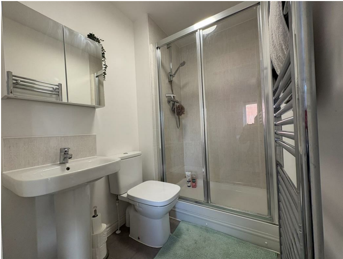
En Suite 4'6 x 6'3 (1.37m x 1.91m)

Three piece suite comprising shower cubicle, wash hand basin with tile splashbacks, WC, heated towel rail.