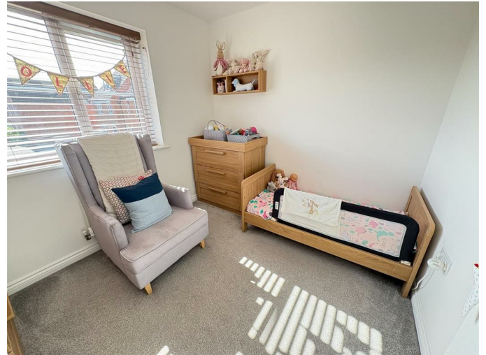
Bedroom 4 8'1 x 9'8 (2.46m x 2.95m)

with uPVC double glazed window to front, radiator