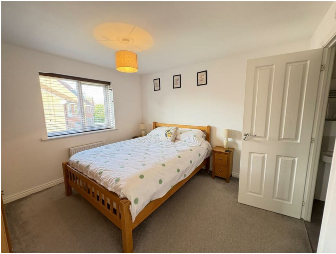
Bedroom 1 10'11 x 11'4 (3.33m x 3.45m)

With uPVC double glazed window to side, radiator, access to;