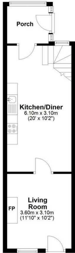
Ground Floor Approx. 34.2 sq. metres (367.9 sq. feet)