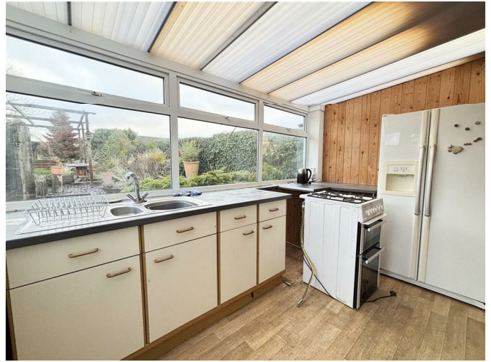
Kitchen 7'3" x 11'10" (2.212m x 3.624m)

The kitchen is fitted with a range of base and drawer units with worktop over incorporating a 1.5 bowl stainless steel sink unit with drainer and mixer tap, there is space for an oven, washing machine and fridge freezer. UPVC double glazed windows to the rear and side with door leading out to the rear garden.