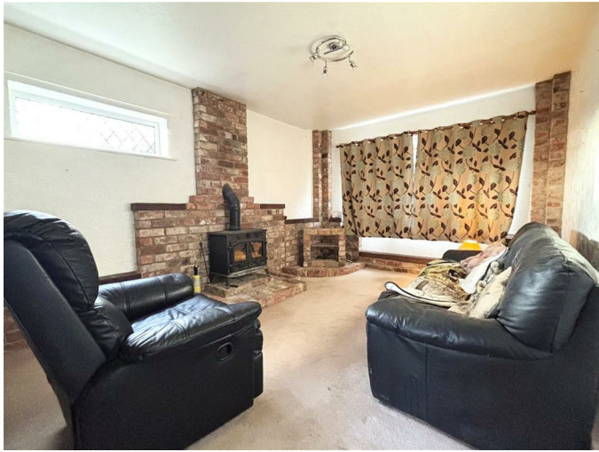
Living room 11'0" x 14'5" (3.357m x 4.399m)

Feature log burner in bricked surround, dual aspect uPVC double glazed windows to the front and side and a radiator.