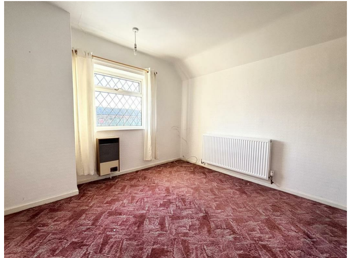
Bedroom 9'6" x 9'10" (2.915m x 3.015m)

With built in storage cupboard, a radiator, uPVC double glazed window to the rear and gas heater.