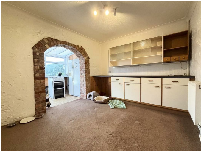
Dining Room 9'10" x 12'6" (max) (3.008m x 3.827m (max))

Fitted with base and drawer units with worktop over, built in storage cupboards and a radiator. Feature brick archways lead into the kitchen and living room.