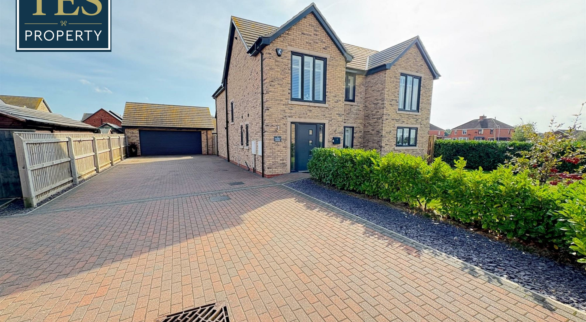
AMELIA WOOD WAY, GRIMOLDBY, LN11 ASKING PRICE £450,000