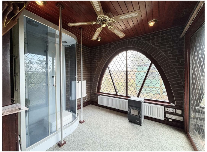
Sun Room 9'5" x 8'4" (2.87m x 2.54m)

Versatile room with is currently being used as a shower room but could make a useful sun room or office. There is a corner shower cubicle with rainfall shower head and sliding doors, ceiling fan, T.V aerial point, window and door to the side and front and two radiators.