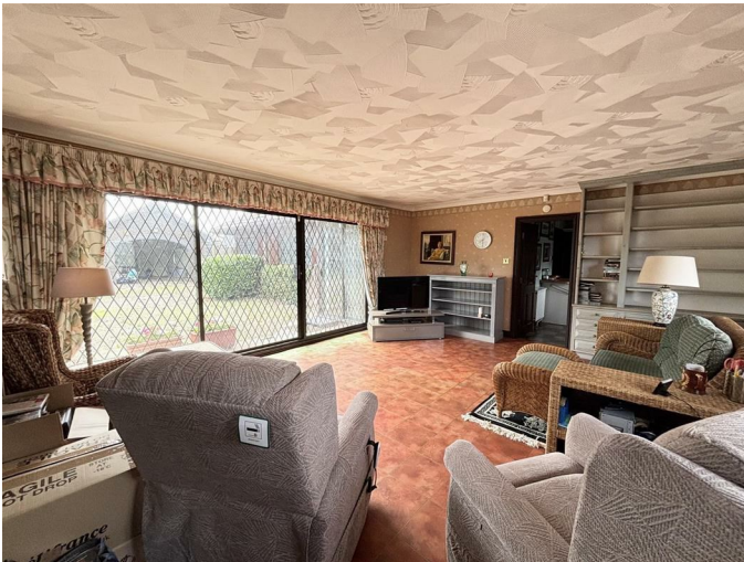
Sitting Room 19'1" x 15'7" (5.82m x 4.75m)

Sizeable room with sliding patio doors leading out to the front, fitted cupboards and shelving unit with two feature circular windows, laminate flooring, T.V aerial point, two radiators and two windows to the side.