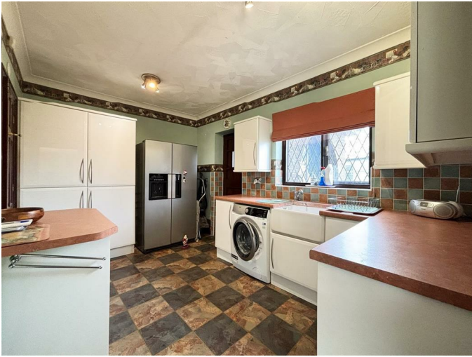
Utility 10'9" x 8'9" (3.28m x 2.67m )

Fitted with a range of wall and base units with worktop over incorporating a Belfast sink with mixer tap, there is space and plumbing for a washing machine, 'American' style fridge freezer. There are tiled splashbacks, window to the side and doors leading into the sitting room and sun room.