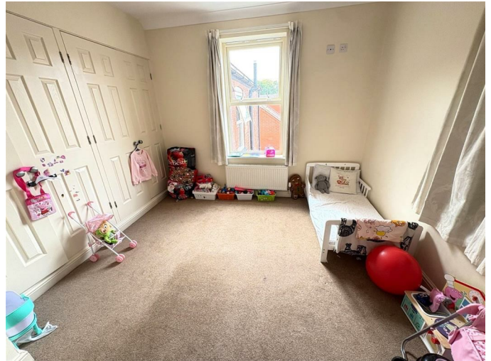
Bedroom 13'2" x 10'4" (4.03m x 3.152m )

With fitted wardrobes and dual aspect uPVC double glazed window to the rear and side.