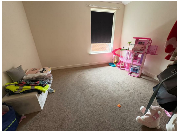
Bedroom 11'2" x 7'7" (3.41m x 2.32m )

With uPVC double glazed window to the rear, radiator and glass panel above doorway.