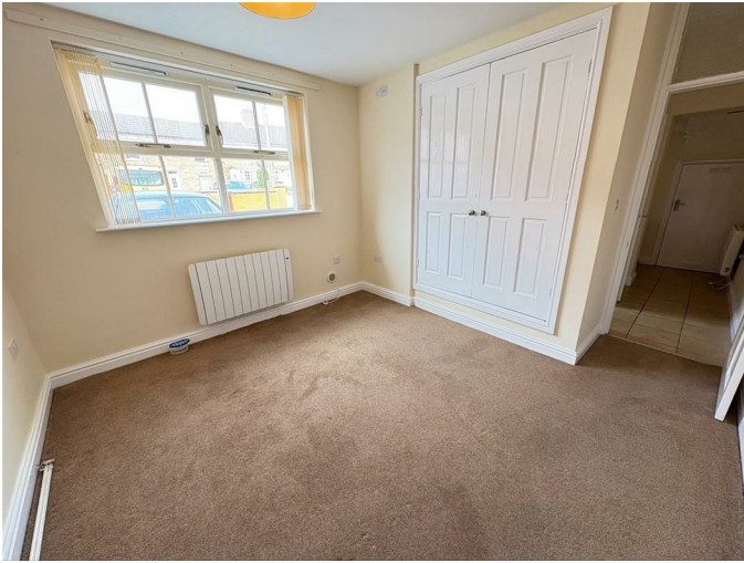
Bedroom 11'1" x 9'11" (3.39m x 3.04m )

With built in wardrobes, electric radiator and uPVC double glazed sash window.