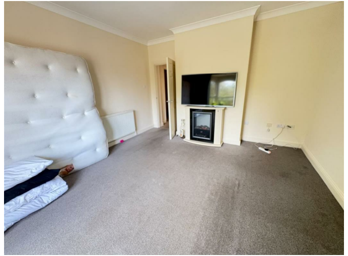
Living Room 14'0" x 12'9" (4.27m x 3.89m )

Feature electric fireplace, single glazed sash windows and radiator.