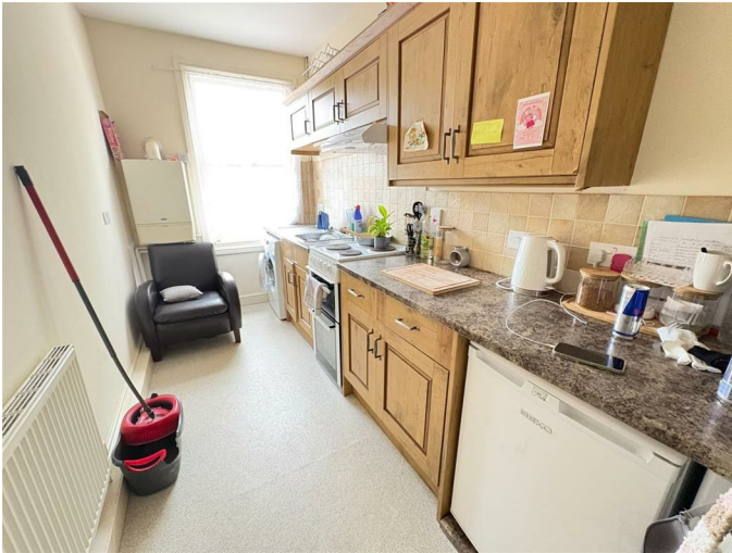
Kitchen 14'0" x 6'0" (4.29m x 1.83m )

The kitchen is fitted with a range of wall, base and drawer units with worktop over with stainless steel sink unit, electric oven and hob, space for a washing machine, tumble dryer and fridge. Single glazed sash window, 'Alpha. boiler, loft access hatch, radiator and consumer unit.