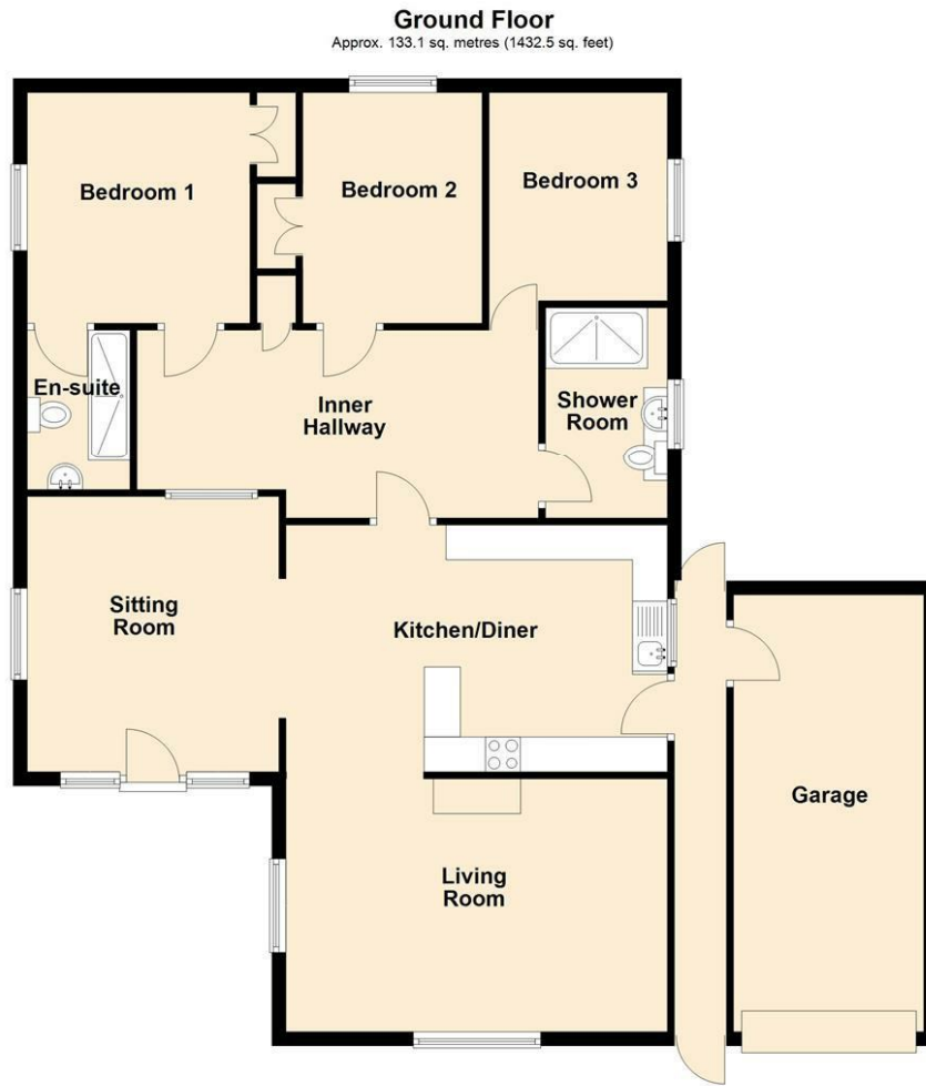
Total area: approx. 133.1 sq. metres (1432.5 sq. feet)