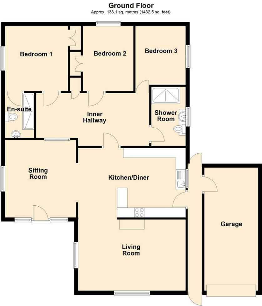
Total area: approx. 133.1 sq. metres (1432.5 sq. feet)