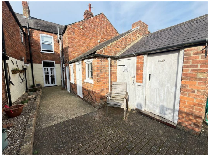
Outside Toilet 6'3" x 3'7" (1.91m x 1.10m) With w.c.