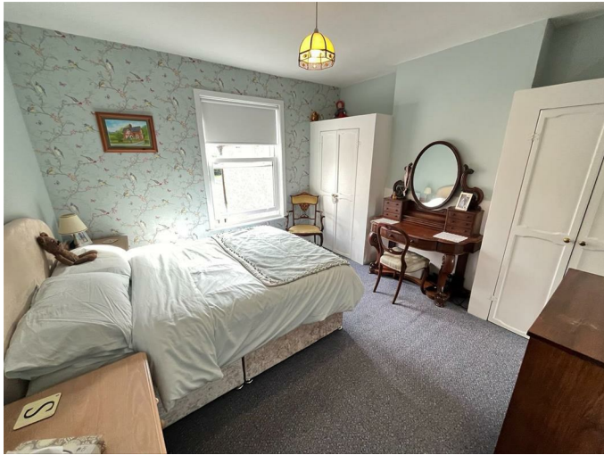
Bedroom 1 12'0" x 11'5" (3.66m x 3.48m)

With two fitted wardrobes, uPVC double glazed sash window to the rear and a radiator.