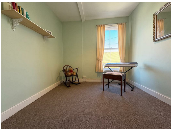
Bedroom 3 8'10" x 9'3" (2.70m x 2.82m)

Single glazed window with additional glazing to the front, glass panel above door and a radiator.