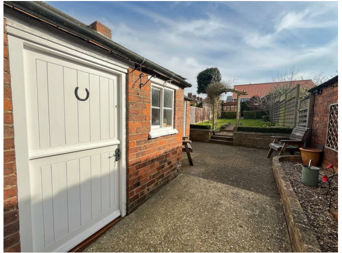
Store 8'9" x 7'8" (2.68m x 2.34m)

Timber barn door and ample room for storage.