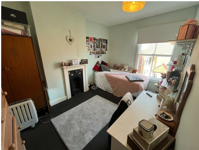
Bedroom 2 12'9" x 8'10" (3.90m x 2.70m)

Single glazed window with additional glazing to the front, decorative fireplace and a radiator.