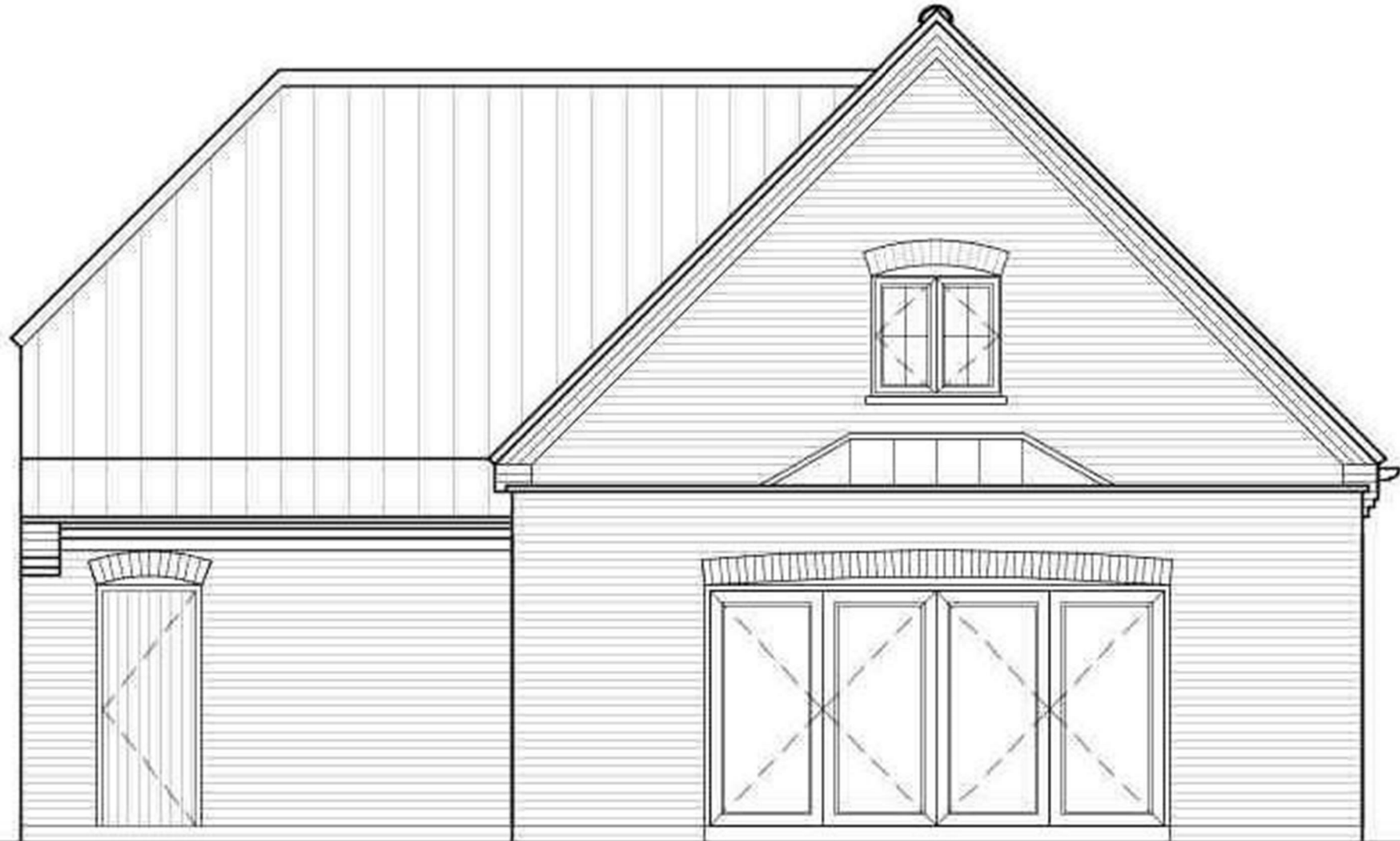
REAR / NORTHERN ELEVATION

With an allowance for the kitchen and bathrooms, viewing is a must to appreciate all is to offer!