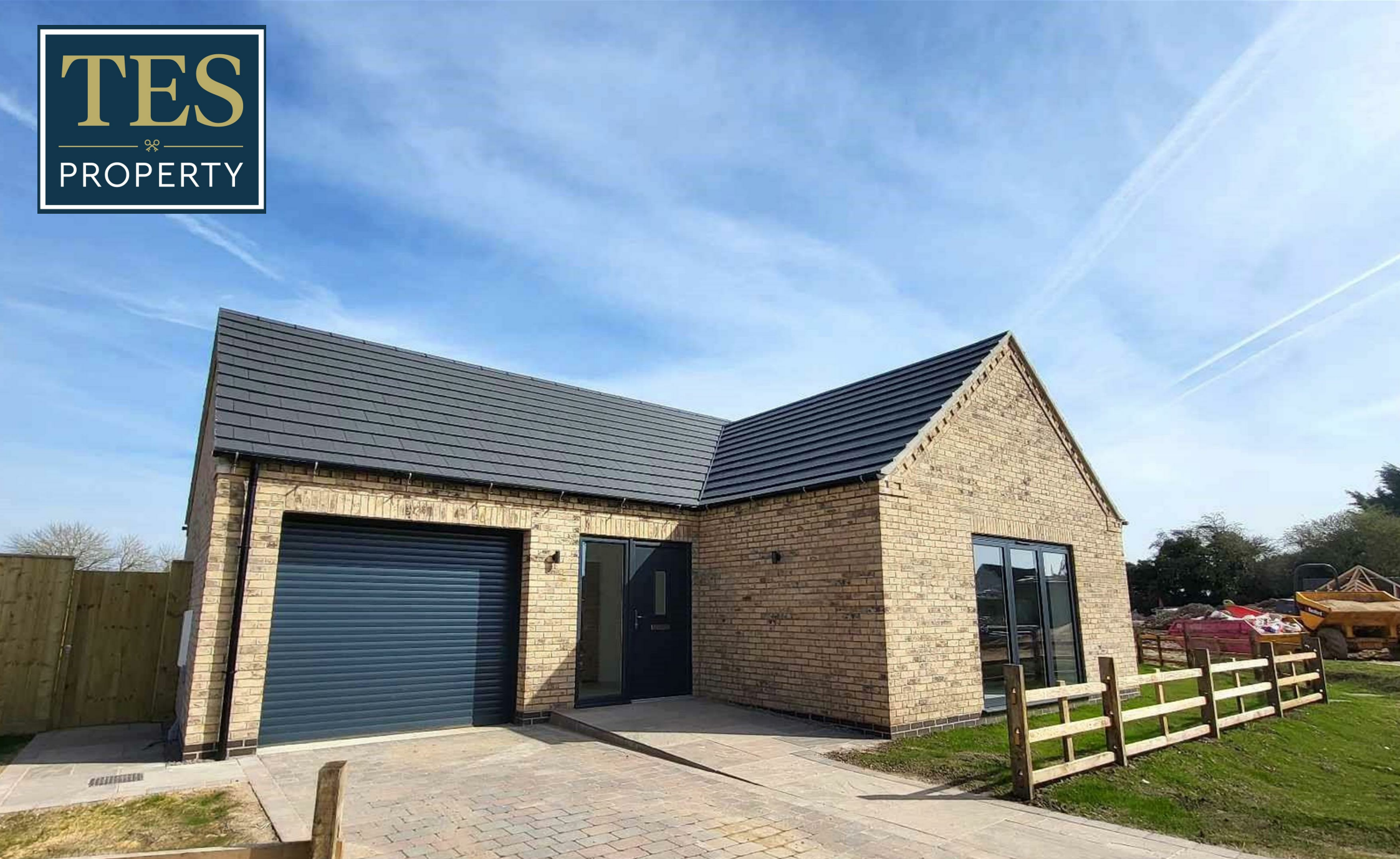
ELLAND WAY, GRAINTHORPE, LOUTH GUIDE PRICE £465,000