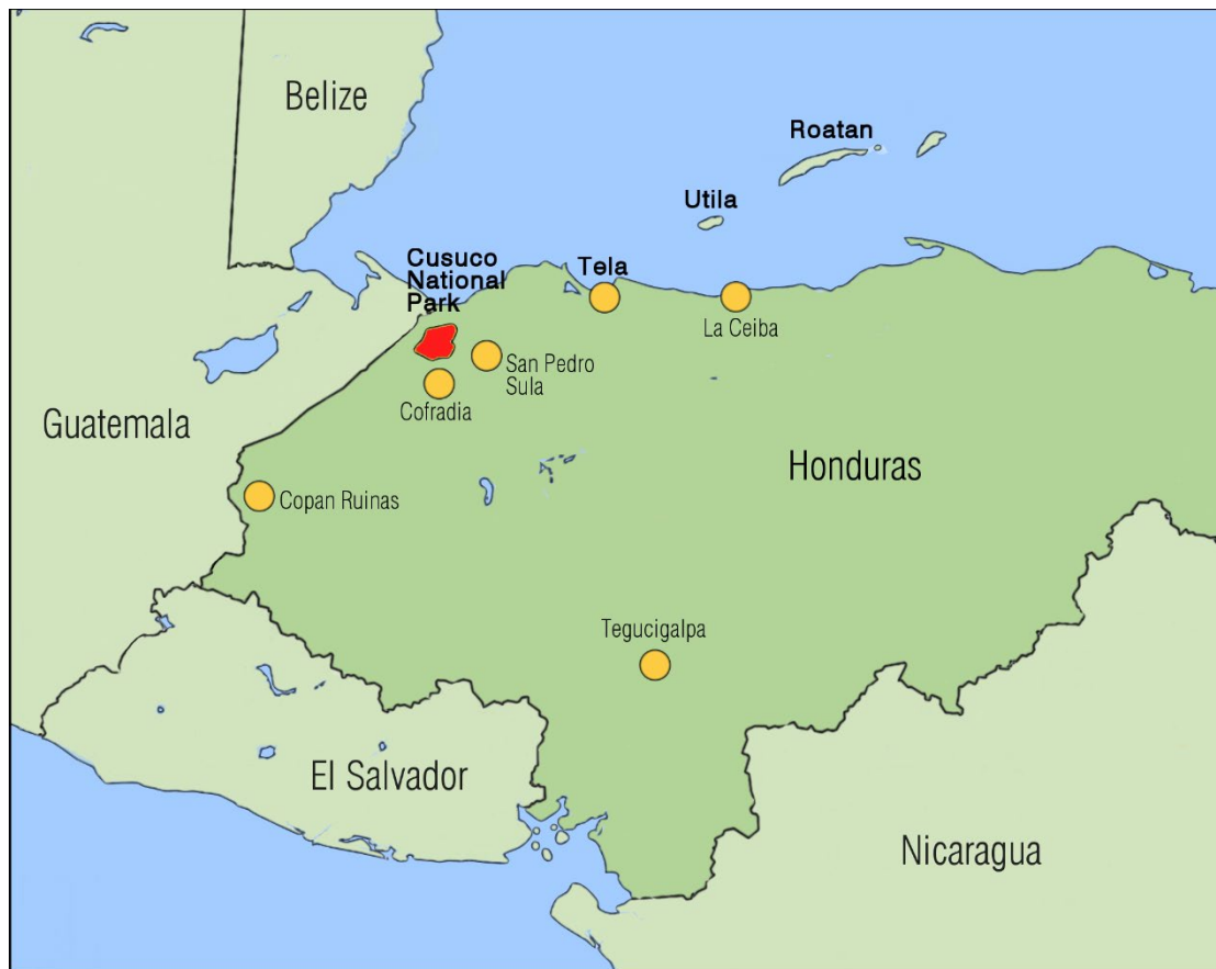
Figure 2 - Location of the marine sites

For the second week the school groups travel to the marine site on Utila to complete a dive training or Caribbean Coral Reef Ecology course. The locations of these sites within Honduras can be seen in figure 2. The address for the Utila base is “Bay Islands College of Diving, By the fire station, Islas de la Bahía, 34201, Honduras”. The ecology course consists of two lectures each day that are supported by a land-based practical component, and two in-water practicals (either diving or snorkelling). The aim is to provide students with an introduction to the marine environment, and to provide them with some knowledge of the methods used to survey coral reefs. Due to logistical restrictions imposed by working in an aquatic environment, students will not be able to partake in active data collection, meaning that the week is much more heavily focused on educational components.