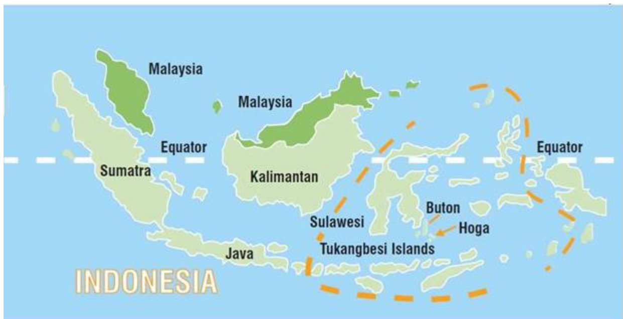
Figure 1. Location of the Wallacea biogeographical region

Sulawesi and the surrounding smaller islands of the Lesser Sundas and the Moluccas were identified as a unique biogeographic region by the naturalist Alfred Russell Wallace in the late 19th century. These islands are now known as the Wallacea region of Indonesia (defined by the area within the dotted line on the map below), and formed their unique fauna due to their isolation from other landmasses by the deep ocean channels that surround the islands. During past Ice Ages sea levels here dropped by up to 100m. This led to the large 'Greater Sunda' islands to the west (Borneo, Java, Sumatra and Bali) being linked to mainland Asia by land-bridges, and therefore allowing large mammalian fauna to spread throughout this area. However, the deep ocean channel between Borneo and Wallacea remained impassable to large mammals, so few are found in the region. The islands to the east of Wallacea would have been linked to Australasia, and have many species of marsupials and other Australian fauna. Again, the ocean channels between Wallacea and New Guinea were too deep for most mammals to cross. However, birds, reptiles and insects were able to cross the channels, and Wallacea has species of both Asian and Australian origin.